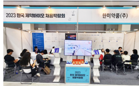
2023 Biopharmaceutical Job Fair

Hanmi Pharm operates various windows of communication to establish an image of recruiting talent based on creation, challenge, and innovation, and to discover talents who will join Hanmi Pharm according to a fair recruitment procedure. We play an active role in the Pharmaceutical-bio Industry Job Fair, the largest exhibition in the industry, while jobseekers can easily obtain information about the pharmaceutical industry and Hanmi Pharm through 'Hanmi Pharm Recruitment TALK,' an online job-briefing session. Furthermore, we provide vivid depictions of various positions in the form of Job V-logs presented by current employees on the YouTube channel 'Hanmi Pharm TV'.